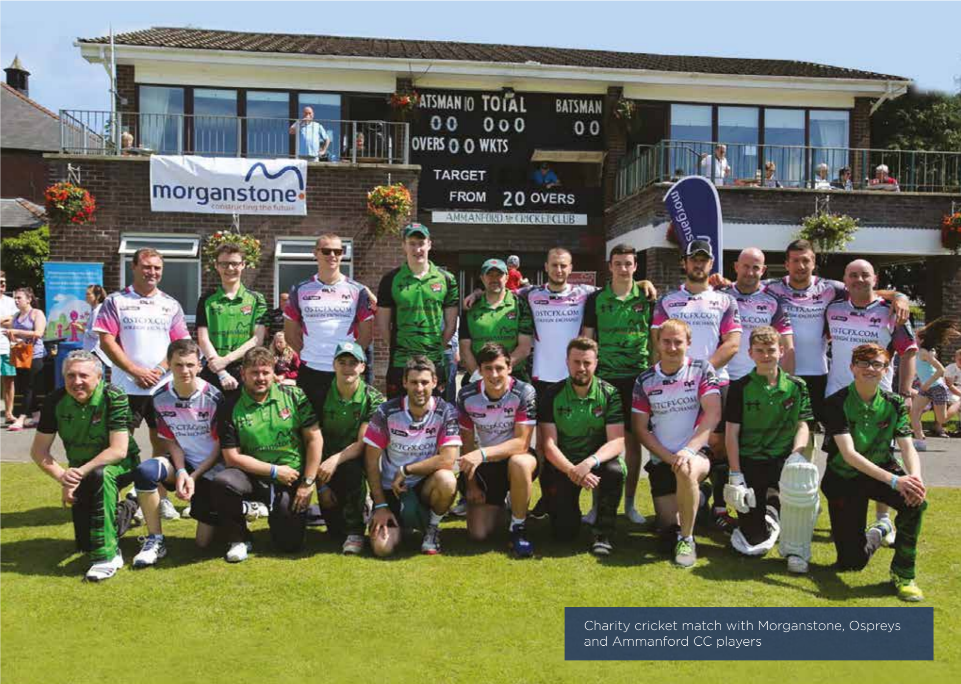
Charity cricket match with Morganstone, Ospreys and Ammanford CC players