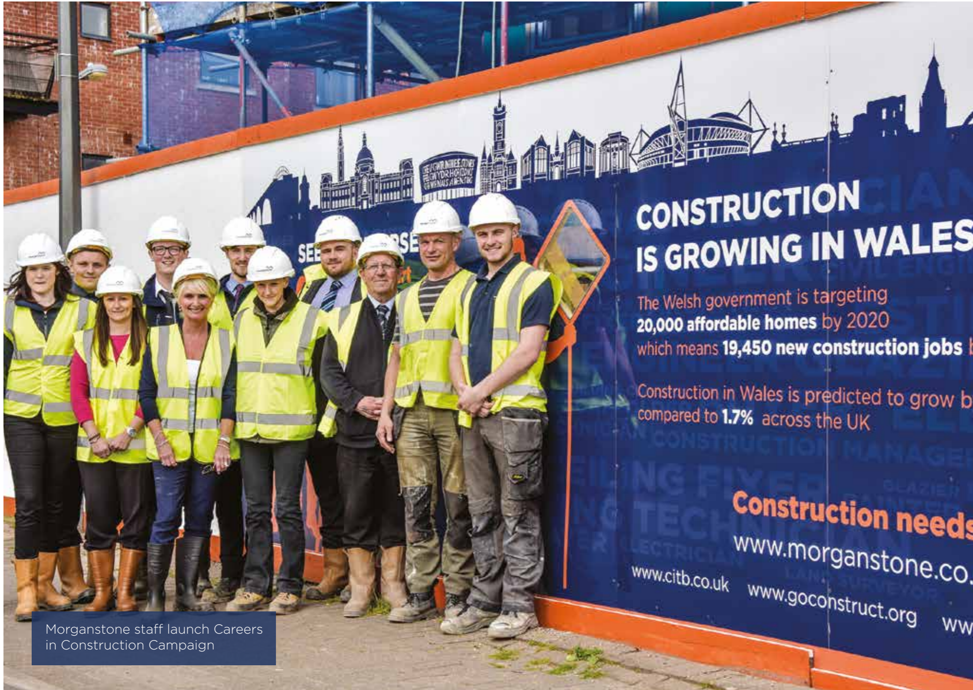
Morganstone staff launch Careers in Construction Campaign