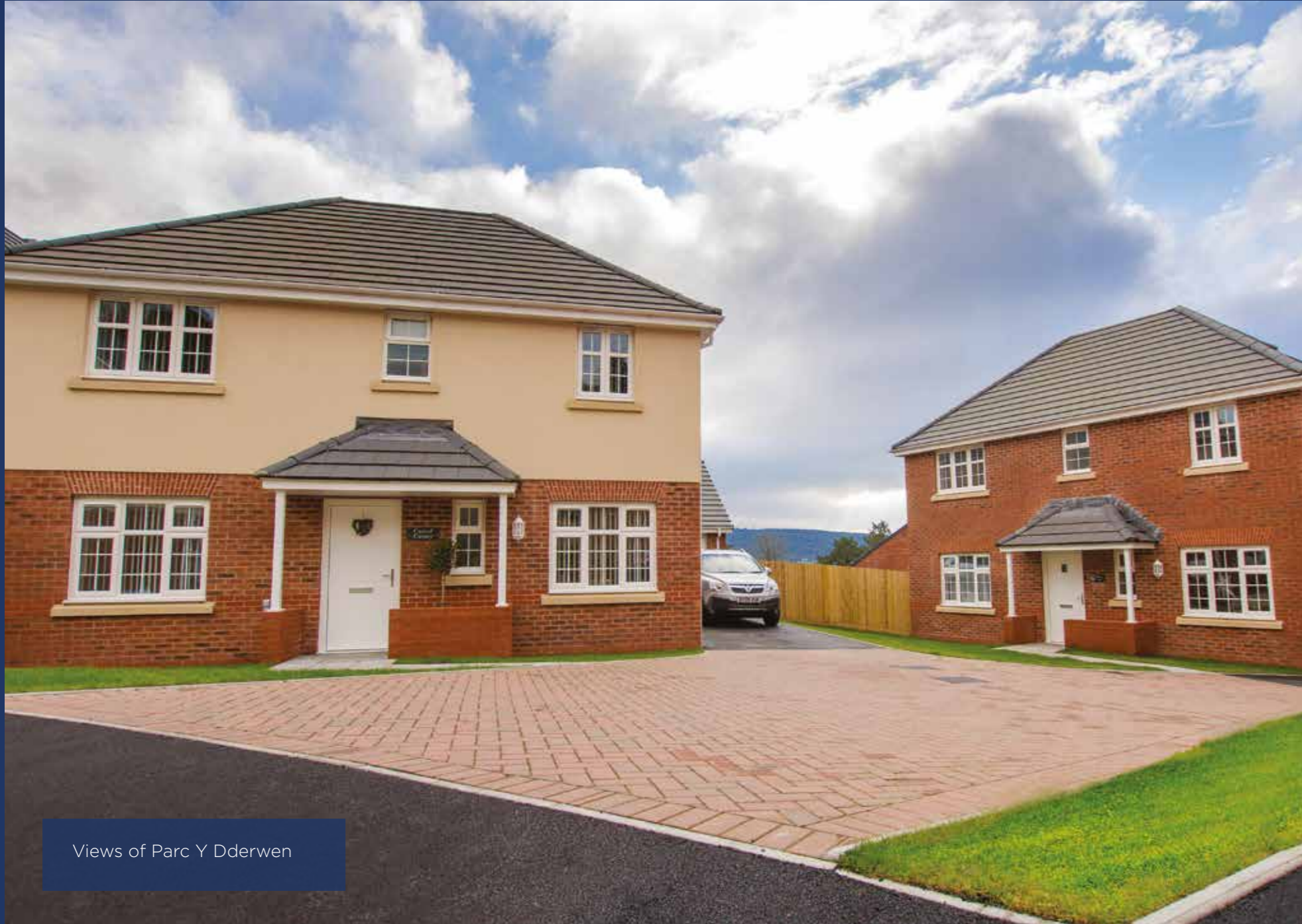
Views of Parc Y Dderwen