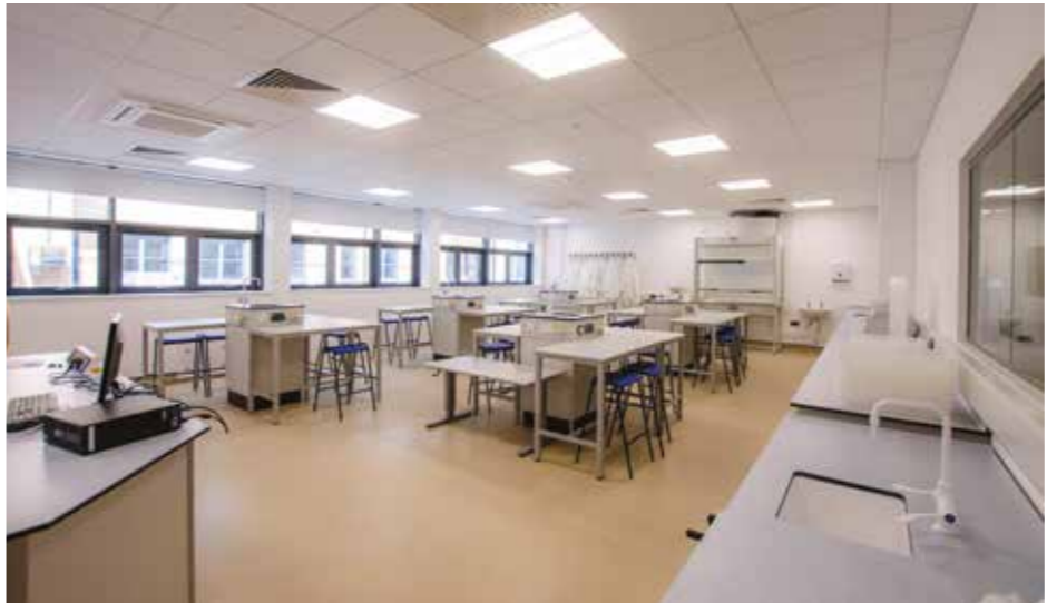
Views of Pembroke Sixth Form College extension

Morganstone was presented with a Silver Award at The Considerate Constructors Scheme's National Site Awards 2018 for the extension of the College.