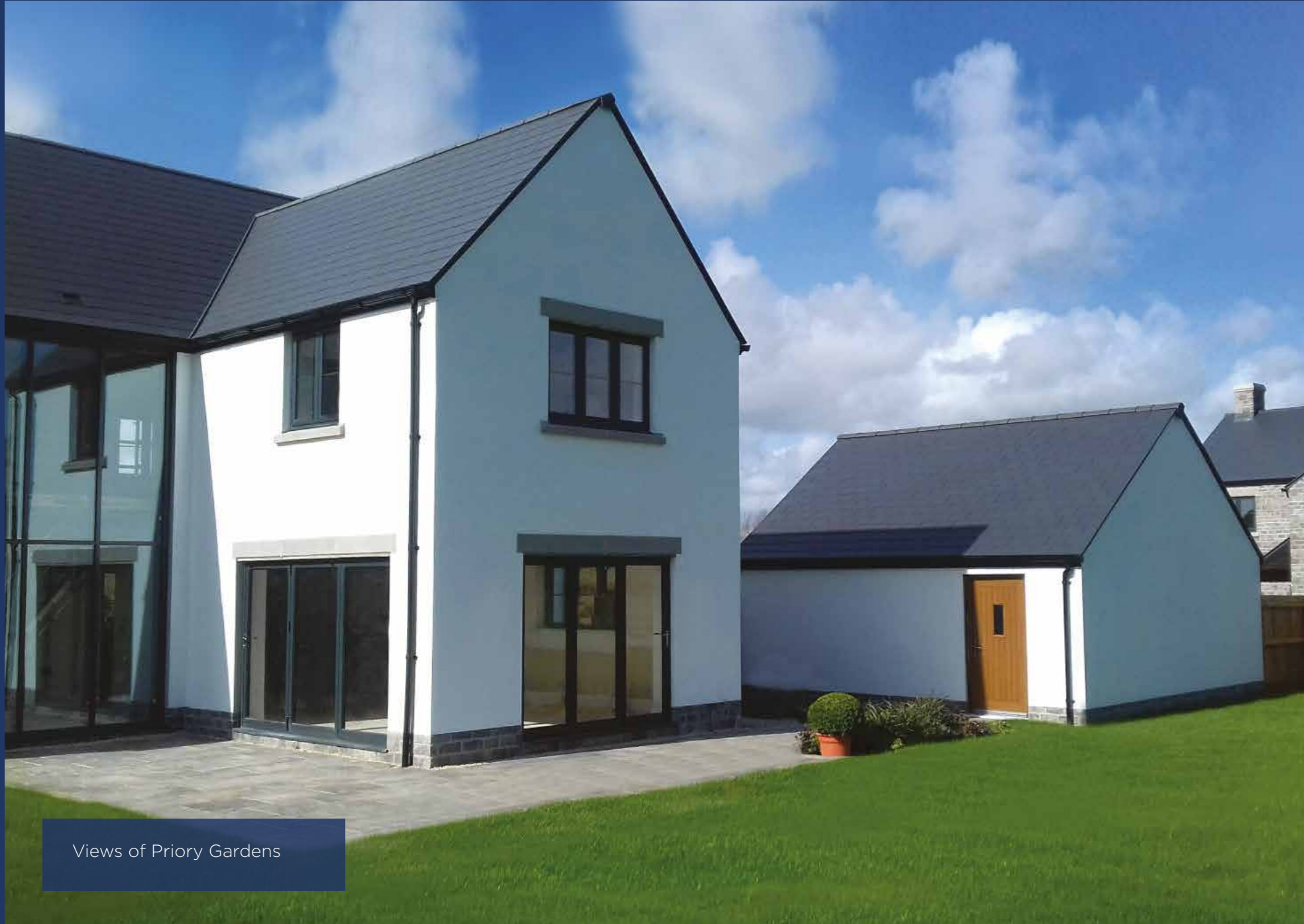
Views of Priory Gardens