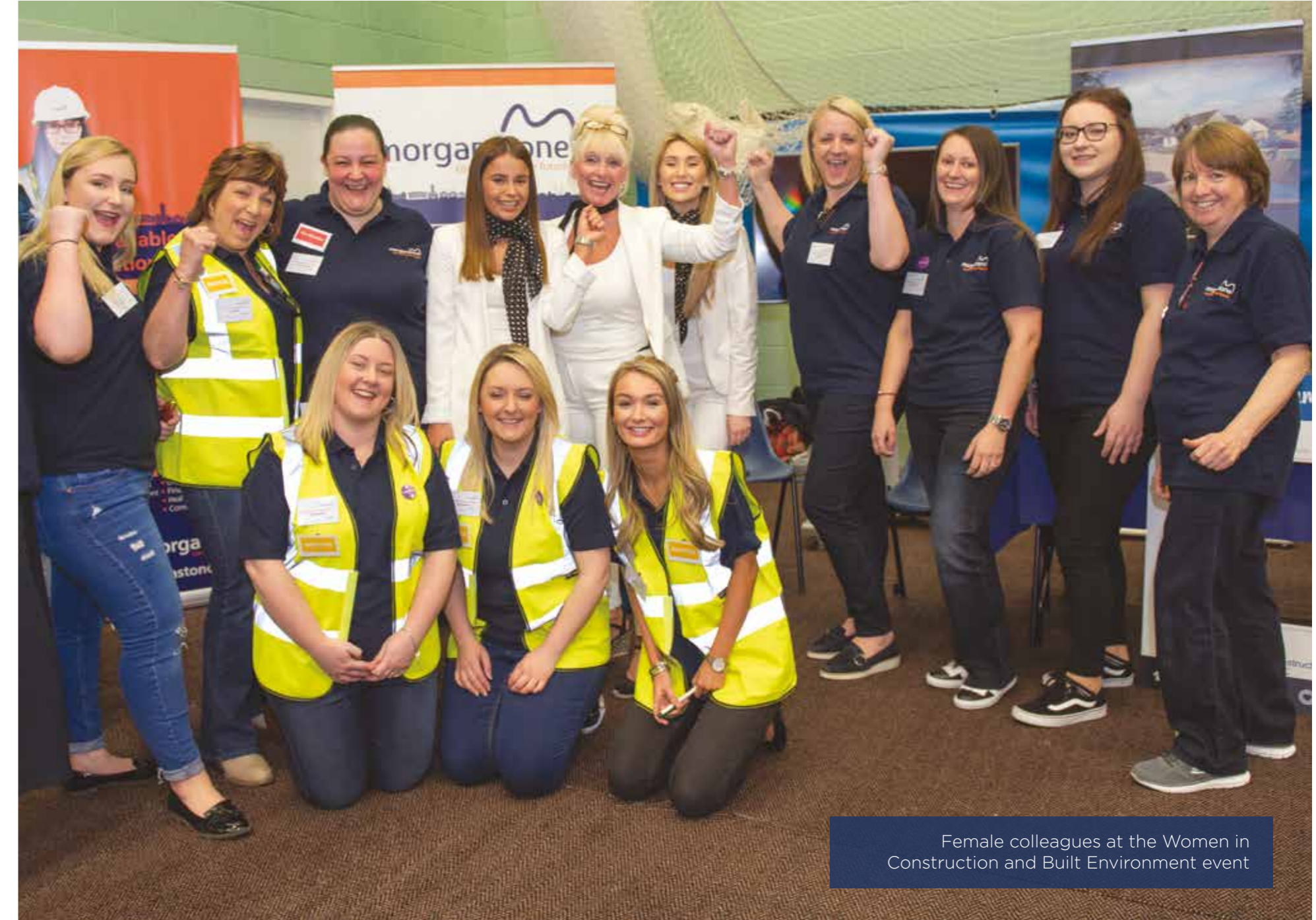
Female colleagues at the Women in Construction and Built Environment event