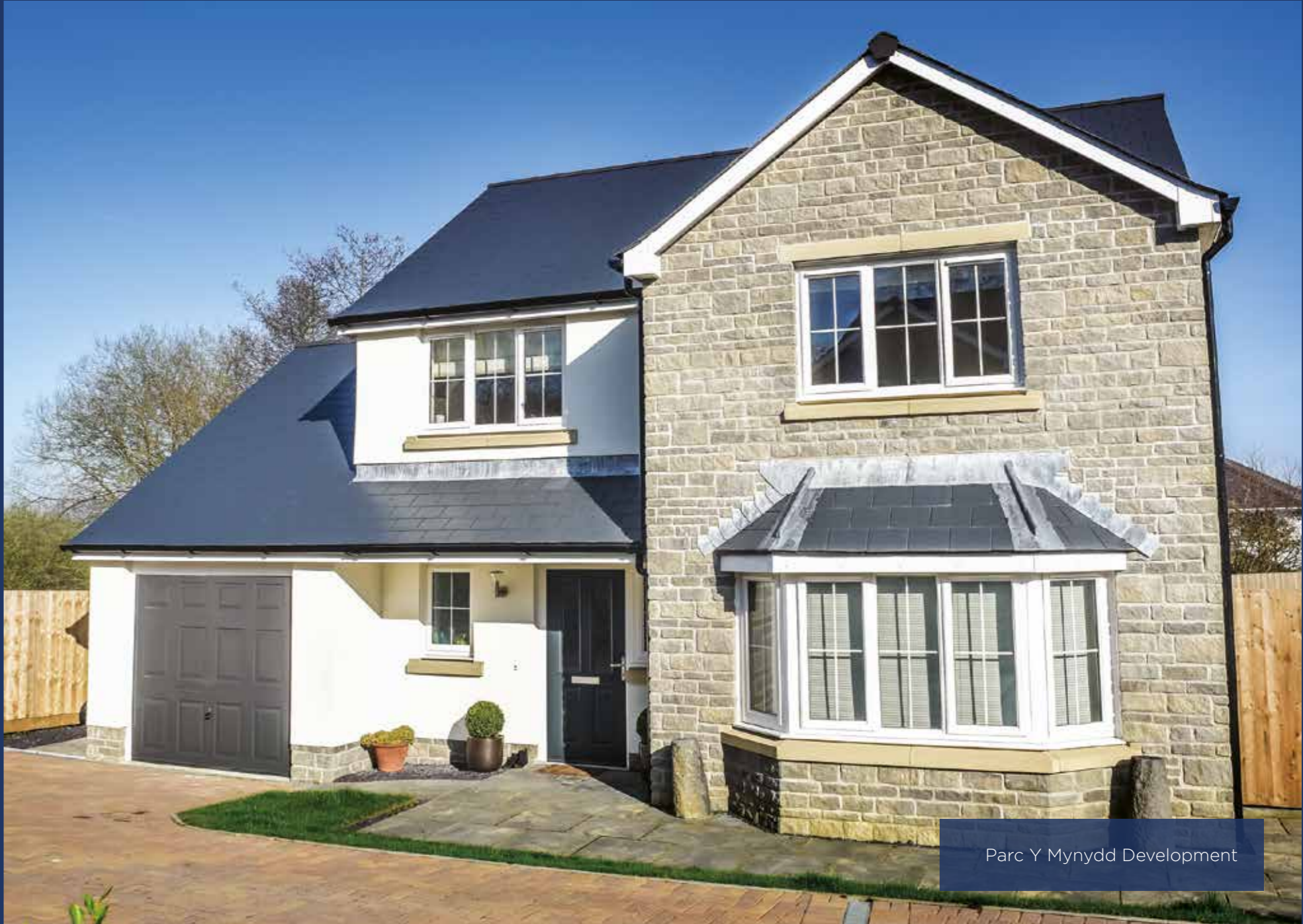
Parc Y Mynydd Development