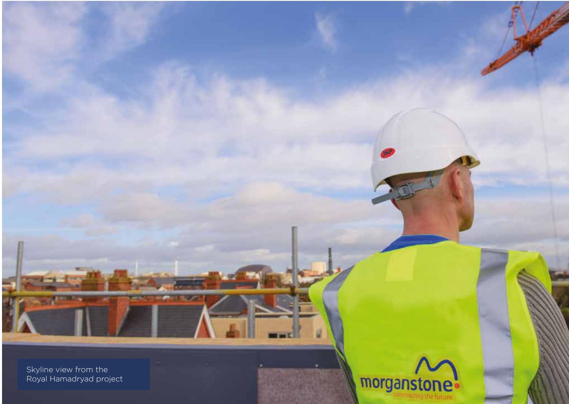
Skyline view from the Royal Hamadryad project