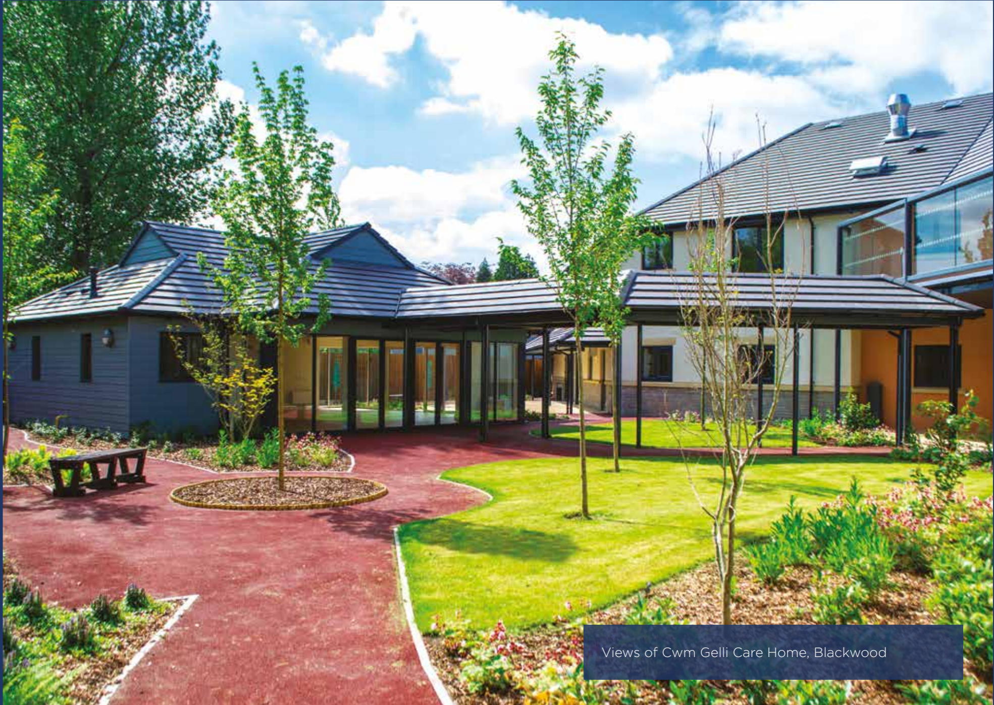
Views of Cwm Gelli Care Home, Blackwood