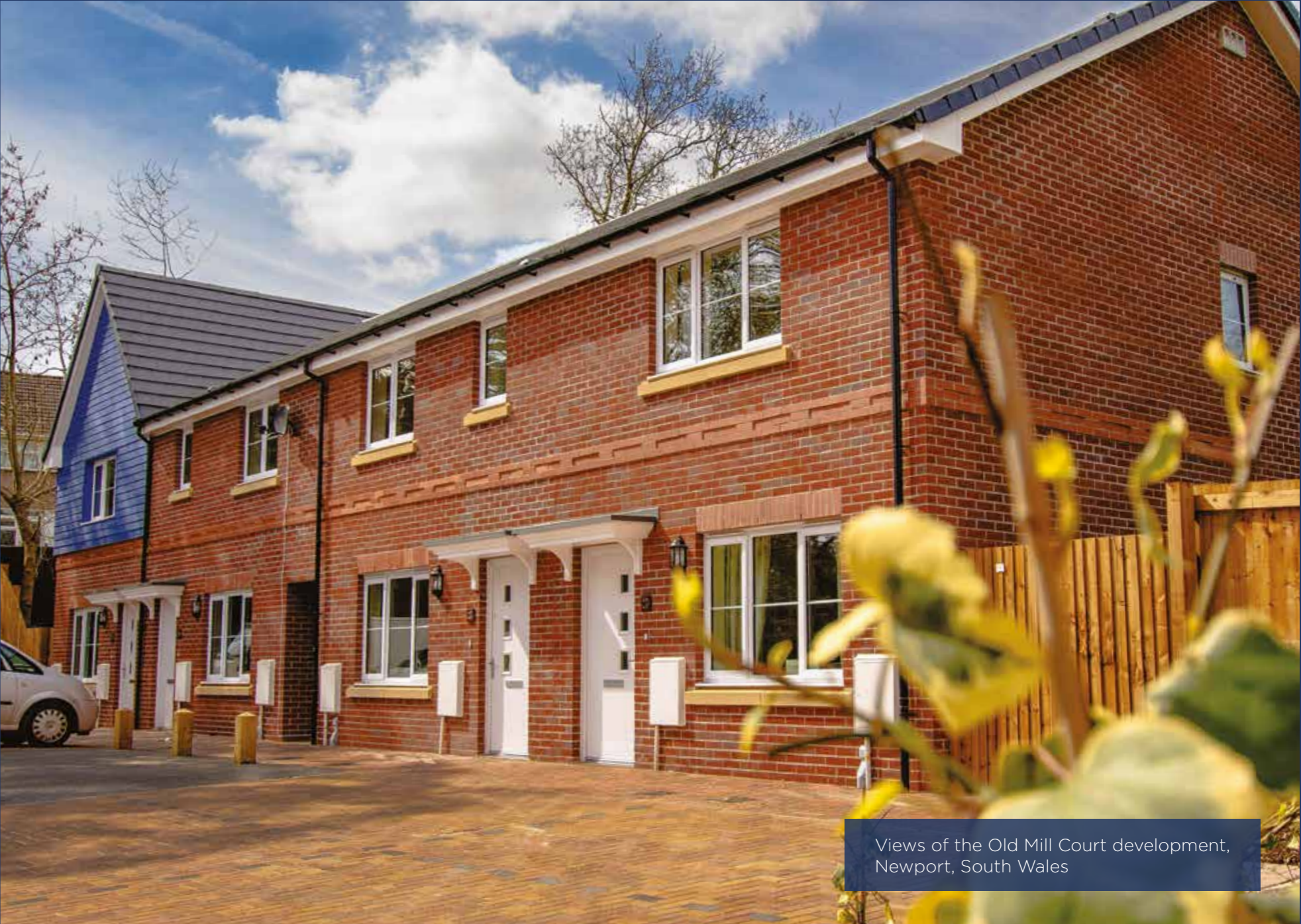
Views of the Old Mill Court development, Newport, South Wales