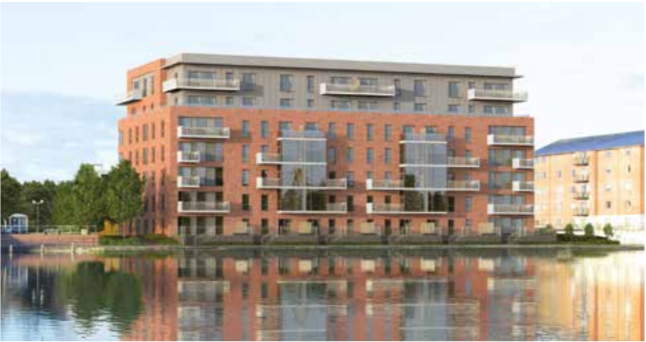
Schooner Way achieved a Bronze Award at the Considerate Constructor Scheme National Site Finals 2018. Royal Hamadryad was short-listed for the New Development Award at the Chartered Institute for Housing, Welsh Housing Awards 2016.