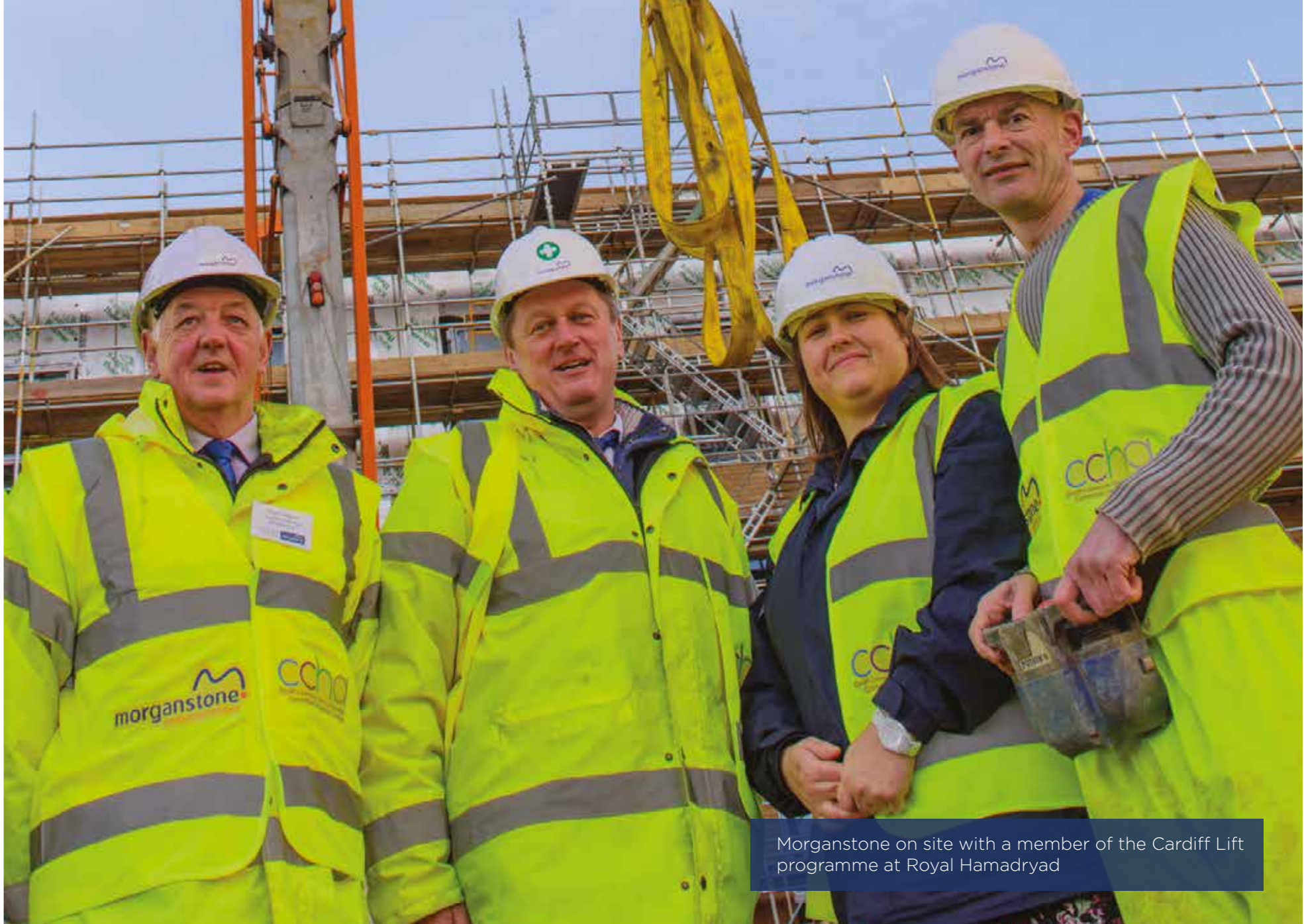
Morganstone on site with a member of the Cardiff Lift programme at Royal Hamadryad