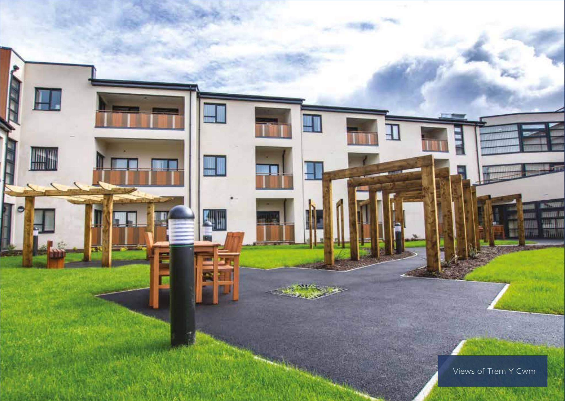
Views of Trem Y Cwm