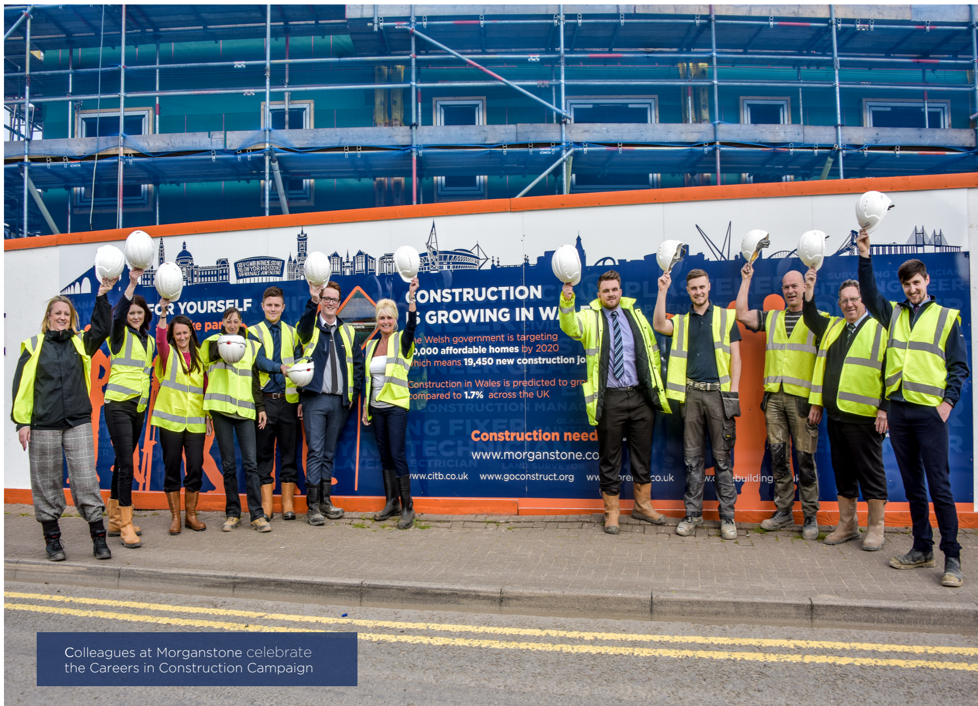
Colleagues at Morganstone celebrate the Careers in Construction Campaign