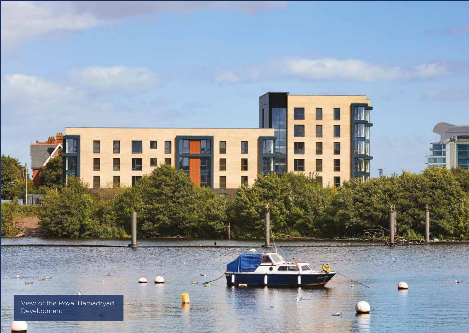
View of the Royal Hamadryad Development

Top: Schooner Way Bottom: Topping out ceremony at Schooner Way