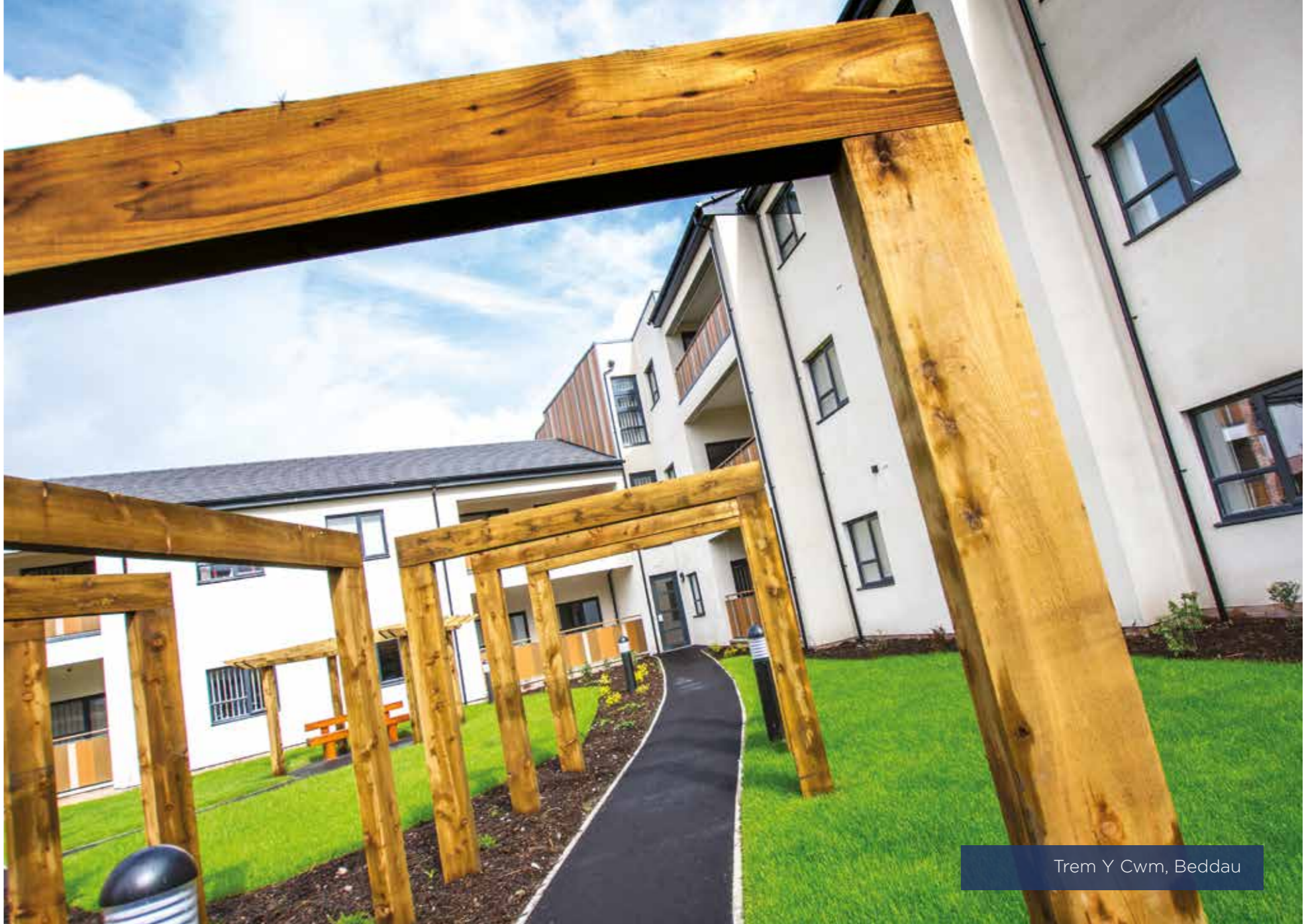
Trem Y Cwm, Beddau